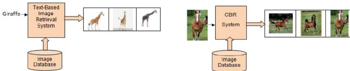
Fig1. Schematic diagrams of a text-based image retrieval system (left) and a content-based image retrieval system (right)